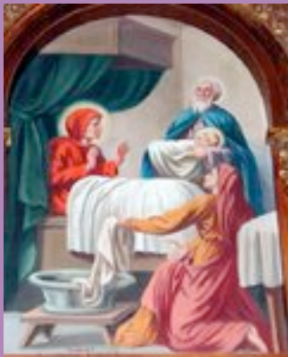
NATIVITY OF THE BLESSED VIRGIN MARY

On September 8, 2011 the Nativity of the Blessed Virgin Mary, a request for assistance was mailed to His Eminence William Cardinal Levada, President Pontificia Commissio "Ecclesia Dei" Rome, Italy.